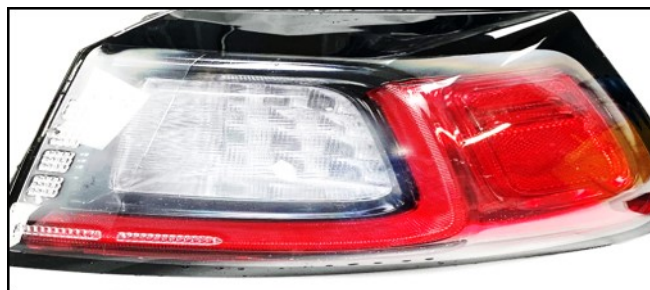
Fig. 1 Clear Tail Lamp Assembly

Some customers may report that on occasion, vehicle exterior tail lamp assemblies are fogged with a light layer of condensation on the inside of the lenses. This may be reported after the lamps have been turned on and brought up to operating temperature, turned off, and then rapidly cooled by cold water (such as rain, or the water from a vehicle wash). Lens fogging can also occur under certain atmospheric conditions after a vehicle has been parked outside overnight (i.e., a warm humid day followed by clear cool night). This will usually clear as atmospheric conditions change to allow the condensation to change back into a vapor. Turning the tail lamps on will usually accelerate this process.