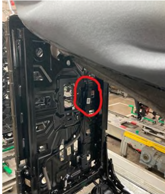
Circled- headrest cable junction block

Carefully pull the seat back and cushion forward to reveal the headrest cables.