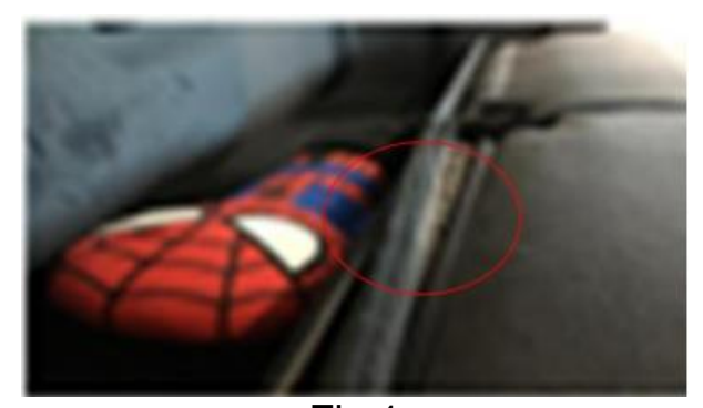
Fig 1 Disengaged J clip example with rear seat folded

Discussion : Inspect the J channel of the rear seat back trim cover. Replace the trim cover if the J clip is broken, cracked or damaged. During normal customer operation the cover J channel will become exposed and could be disengaged by loading and unloading of items from the back seat. This damage could cause the trim cover to become loose and the J channel damaged. Ensure the J channel is fully installed using a trim stick (fig 2).