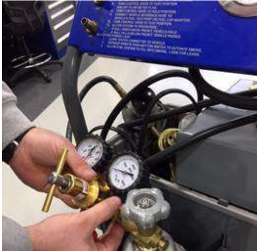
Figure 2. Installing NITROKITG manifold set.