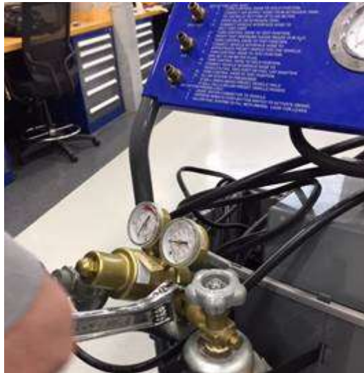
Figure1. Removing the KLI9210DLX manifold.

Before setting up the NITROKITG on the vehicle, check for pressure in the refrigerant circuit. If there is refrigerant in the system evacuate the refrigerant circuit using an approved R134a/R1234yf refrigerant station.