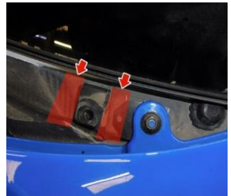
Example of Rework on the Right side