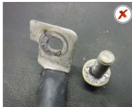
Fault type – ground strap and ground screws