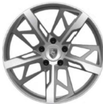
Cross Turismo Design Wheel