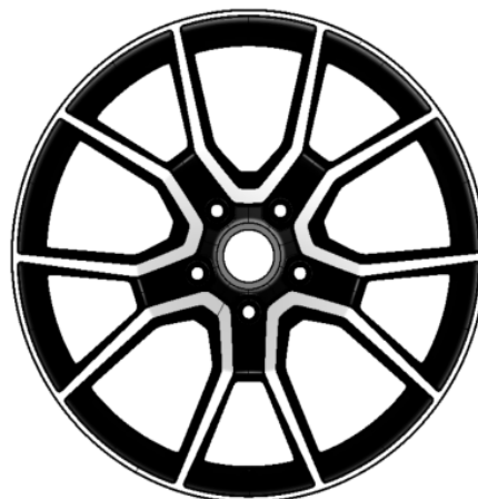
RS Spyder Design Wheel