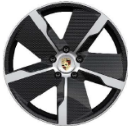
Exclusive Design Wheels with carbon-fibre aeroblades