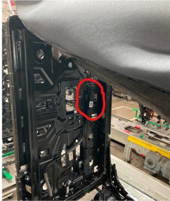
Circled- headrest cable junction block

Carefully pull the seat back and cushion forward to reveal the headrest cables.