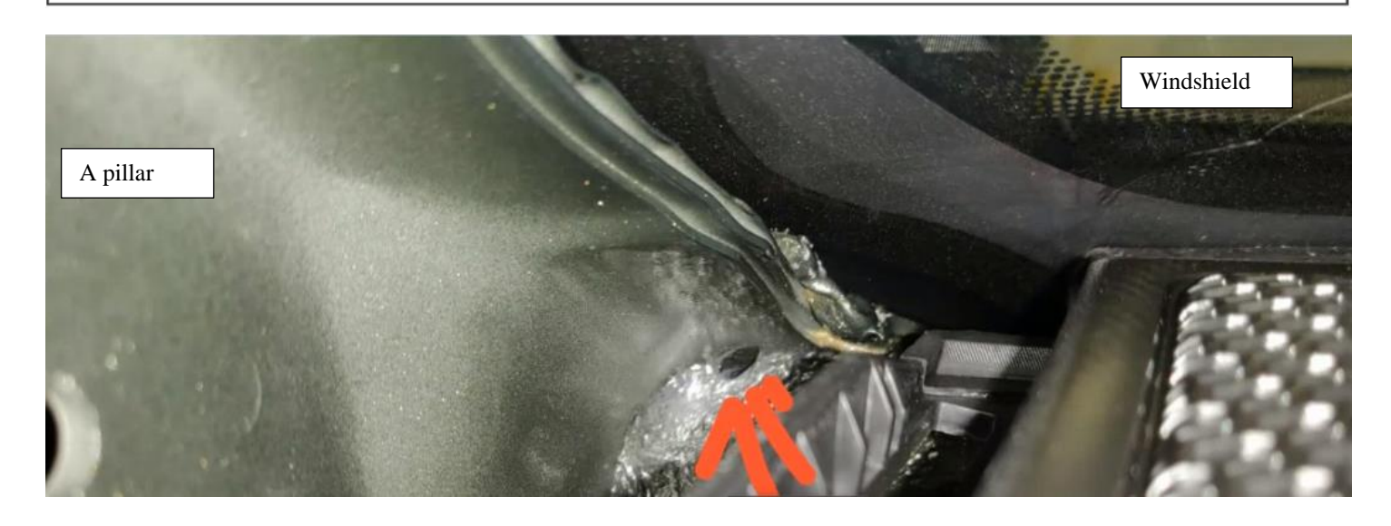
Example of a void in sealer viewed with A Pillar trim removed

This document does not authorize warranty repairs. This communication documents a record of past experiences. STAR Online does not provide any conclusions about what is wrong with the vehicle. Rather, it captures all previous cases known that appear to be similar or related to the vehicle symptom / condition. You are the expert, and you are responsible for deciding on the appropriate course of action.