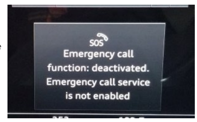
Figure 1. SOS warning in the instrument cluster.

The warning message "SOS Emergency call function deactivated" is seen in the instrument cluster (Figure 1 or 2).