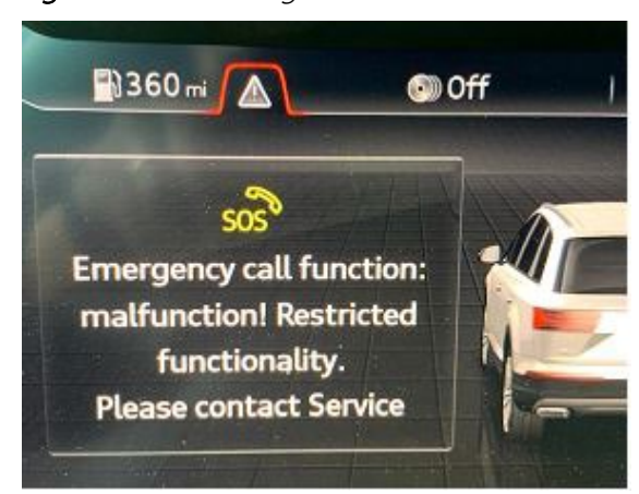
Figure 2. SOS warning in the instrument cluster.