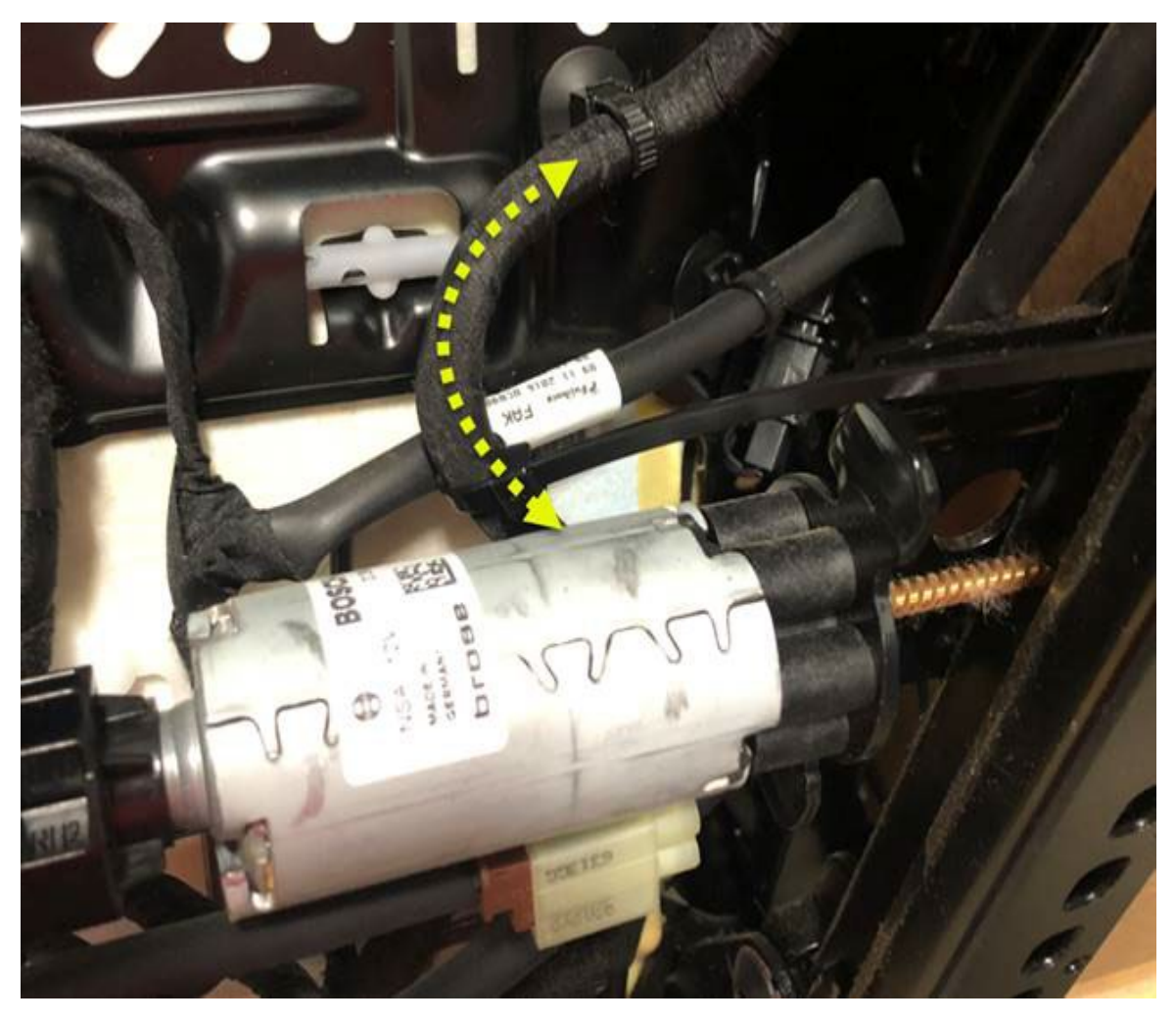
Figure 3. Attach the second cable tie to the yellow marked area.