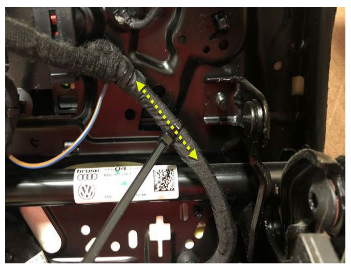
Figure 2. Attach the first cable tie in the yellow area.

3. The second cable tie position is to the rear of the crossbar tube where the harness drops down from the frame. Place the cable tie in the yellow marked area shown below (Figure 3).