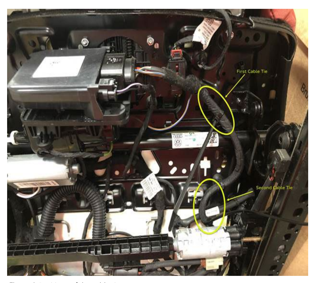
Figure 1. Positions of the cable ties.