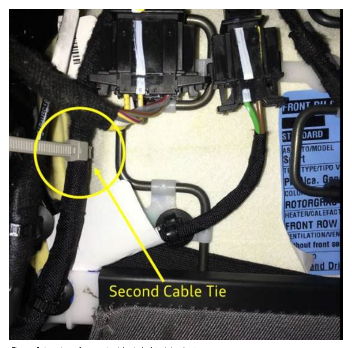
Figure 6. Position of second cable tie behind the 8-pin connector.