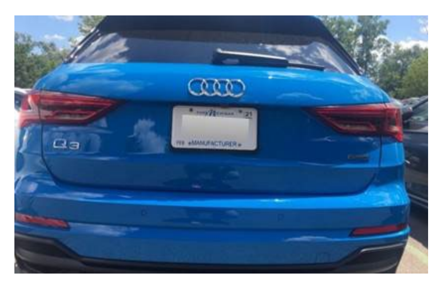
Figure 2. The rear license plate successfully installed on the new Q3.

2. The license plate <u>without</u> the frame will be successfully installed on the rear license plate holder without any interference.