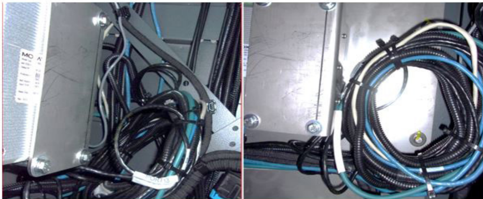
Figure 1 - Moxa Swith in the ITS Box