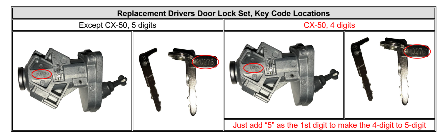
Page 2 of 3

CONSUMER NOTICE: The information and instructions in this bulletin are intended for use by skilled technicians. Mazda technicians utilize the proper tools/ equipment and take training to correctly and safely maintain Mazda vehicles. These instructions should not be performed by "doit-yourselfers." Customers should not assume this bulletin applies to their vehicle or that their vehicle will develop the described concern. To determine if the information applies, customers should contact their nearest authorized Mazda dealership. Mazda North American Operations reserves the right to alter the specifications and contents of this bulletin without obligation or advance notice. All rights reserved. No part of this bulletin may be reproduced in any form or by any means, electronic or mechanical---including photocopying and recording and the use of any kind of information storage and retrieval system ---without permission in writing.