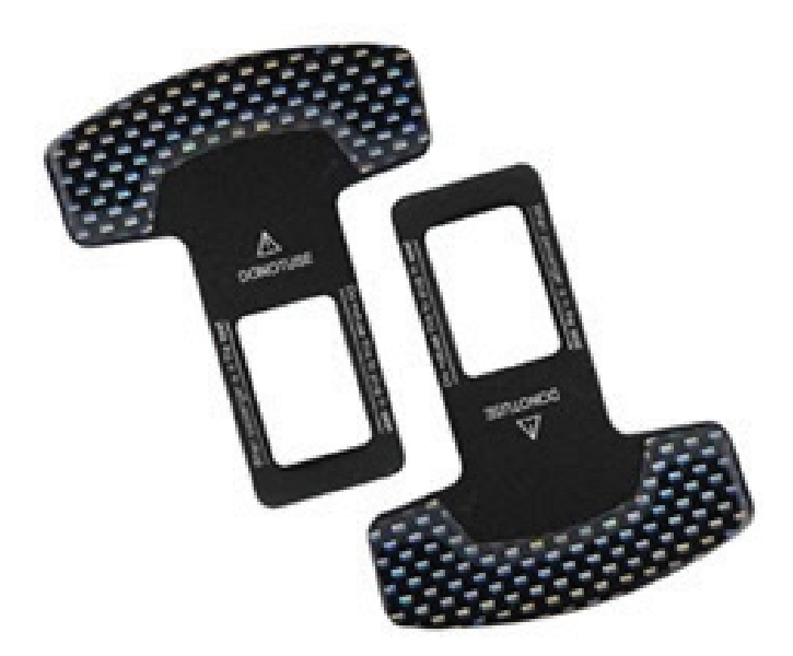
Figure 2: Example of dummy seat belt buckles