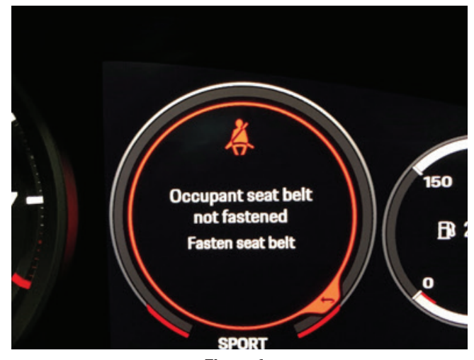
Figure 1: Red warning in the instrument cluster

The customer complains of a red warning message in the instrument cluster that reads, "Occupant seat belt not fastened. Fasten seat belt." This message appears despite all seat belts being fastened.