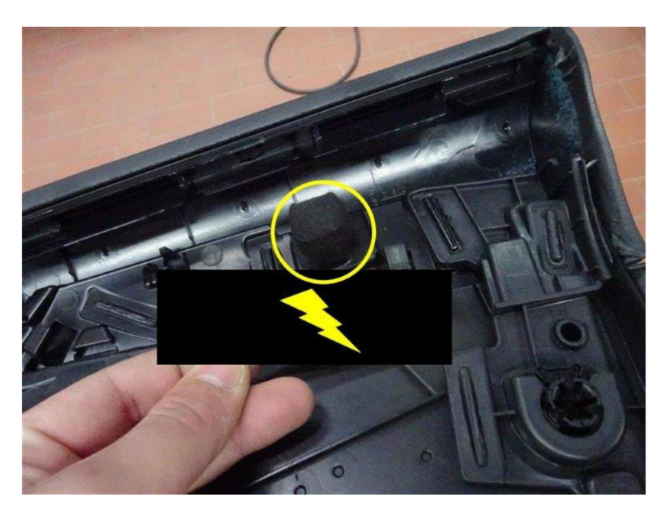
Figure 2. Incorrect application of fleece tape on crash element. Do not attach anything to the crash element or its retaining clamp!