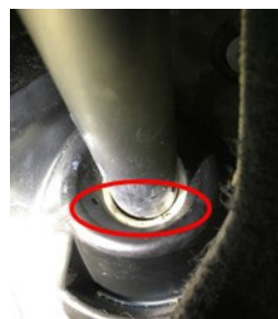
Figure 1. Poor sealing on the intermediate shaft.