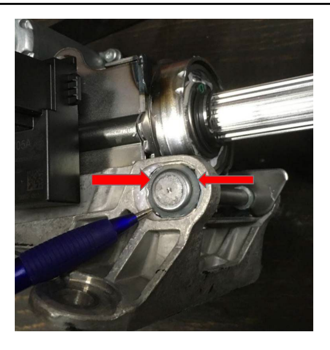
Figure 1. Lower pin/hinge – steering column.