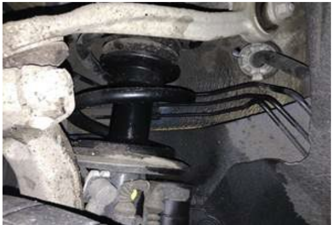
Figures 2, 3, and 4. Oil marks/residues in the wheel housing/shock absorber.