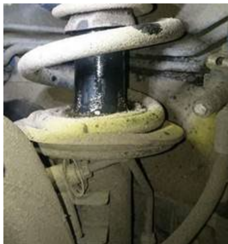
Figure 1. DRC shock absorber with clear oil loss.