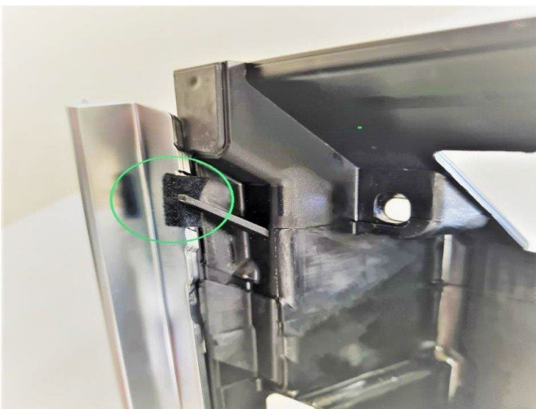
Figure 2. Felt tape applied between the rib of the display mount and the trim frame.

4. Only on the side of the contact, apply a strip of felt tape (approx. 3/4 x 3/8 inch) between the rib of the display mount and the trim frame to increase the gap to the display on that side only (Figure 2).