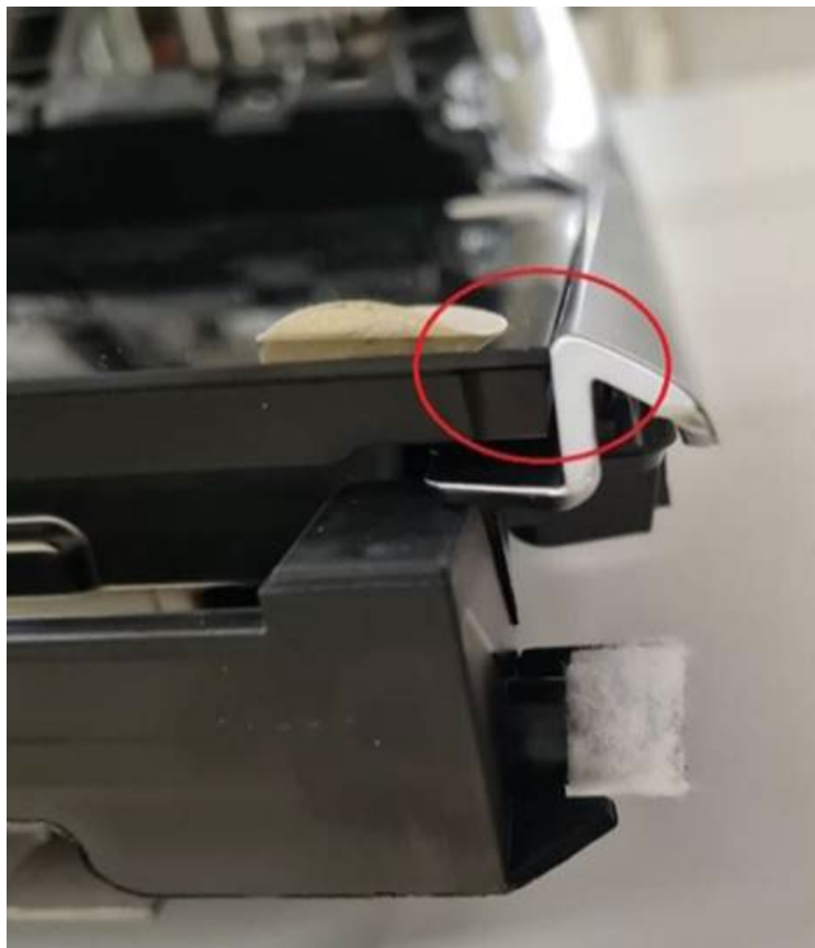
Figure 1. Hard contact between lower MMI display and center console insert/trim.

Due to the tight assembly tolerances, the lower MMI display may make contact with the center console insert/trim (Figure 1).