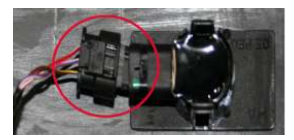
Figure 7. Example of a parking aid sensor connector that is not seated correctly.

• If the cable is too tight, correct the routing by moving the support clip so the cable is no longer under tension.