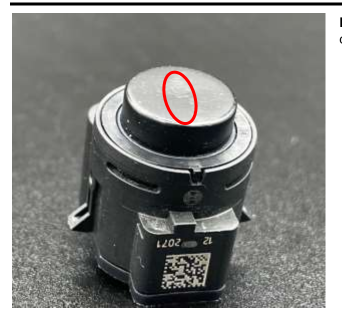
Figure 3. Stone impact (surface deformationdent).