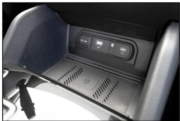
Wireless Phone Charger in 23MY Sportage