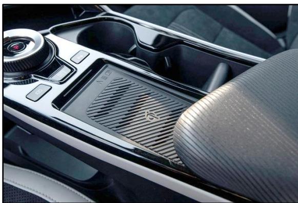
Wireless Phone Charger in 22MY EV6

Note: A Qi® certified cell phone is required to check the wireless phone charger functionality.