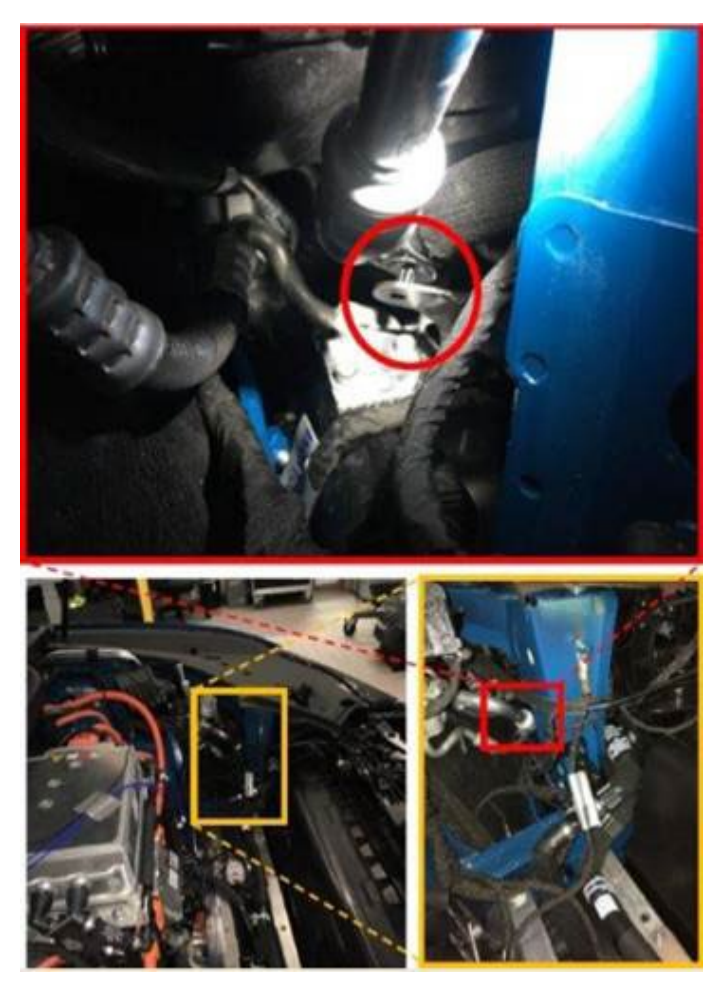
Figure 4. The area in the motor bay where contacting lines are located.

3. These refrigerant lines must be separated and, if necessary, retained in a separated state using a hose holder, clip, or tie-wrap (Figure 4).