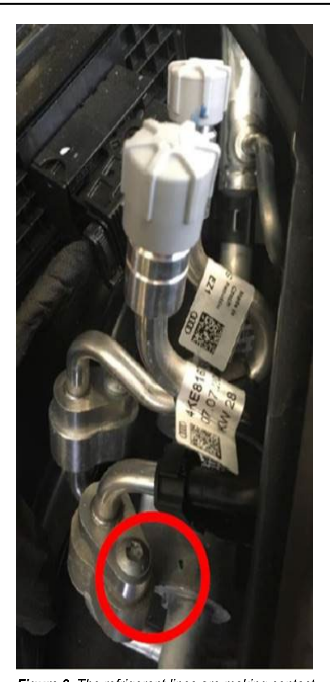
Figure 2. The refrigerant lines are making contact.

1. Figure 2 shows the refrigerant lines are close enough to make contact to elicit the noise.