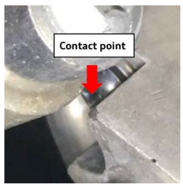
Figure 3. Point of contact.

2. Figure 3 shows a close-up view of the point of contact.