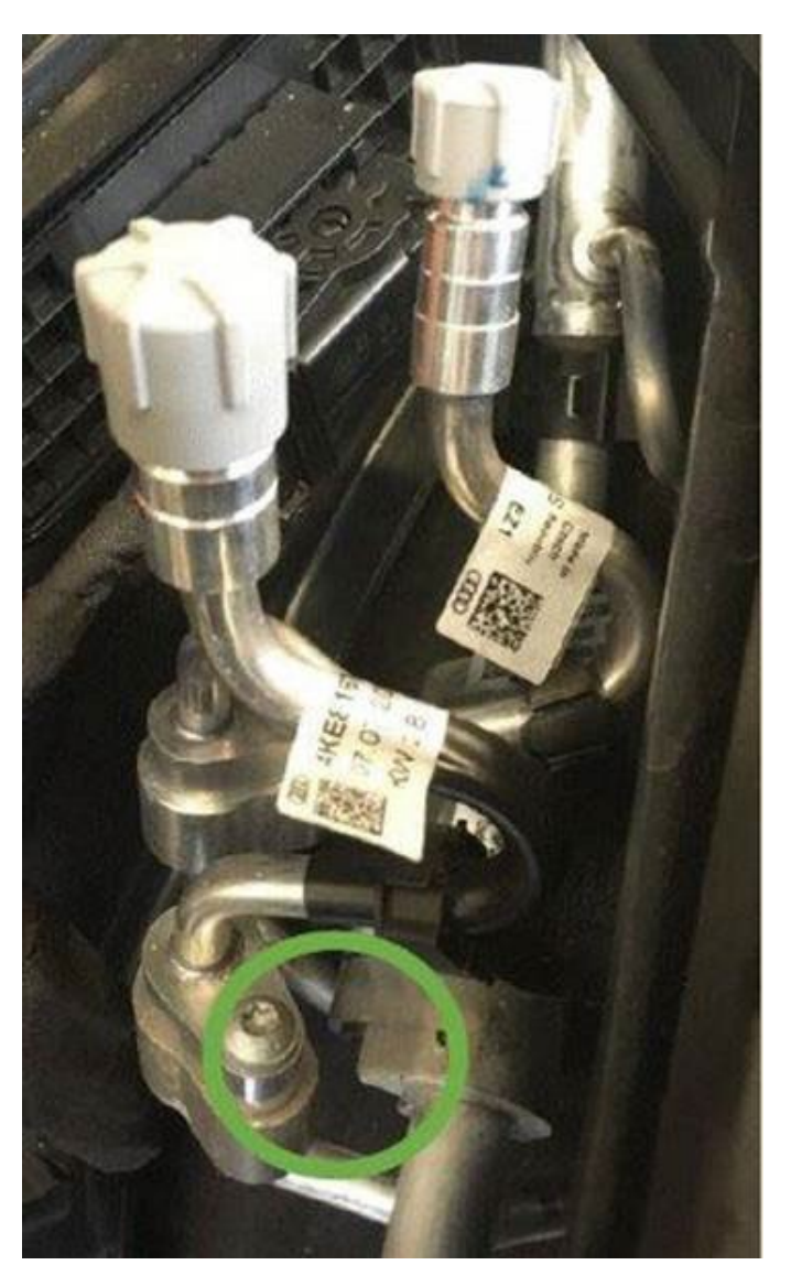
Figure 5. The refrigerant lines have been separated.

4. Figure 5 shows properly separated refrigerant lines.