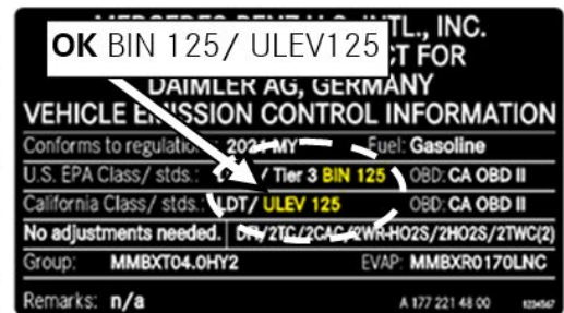
Figure 2, OK BIN125/ULEV125