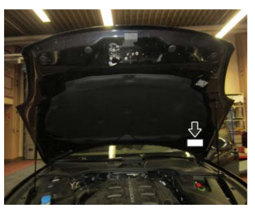
Proof of Completion Label: specified position (Exemplary illustration — 911 (991), Boxster/ Cayman (981) position accordingly)

A template of the proof of correction can be downloaded from PPN: https://ppn.porsche.com/portal/docs/DOC-387933