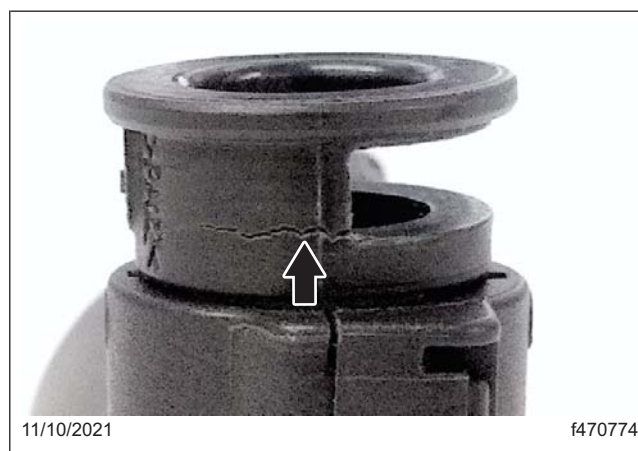
Fig. 1, Line Damage Resulting from Freezing DEF

If the vehicle has sustained a line separation resulting from frozen DEF, and the line is damaged, it must be replaced. Separate the line from the fitting (port), remove the white retaining clip, and inspect the line connector for damage. See Fig. 1 .