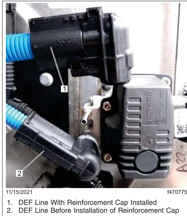
Fig. 2, Reinforcement Cap Installation

> Business Class M2 > Cascadia > 108SD/114SD > New Cascadia