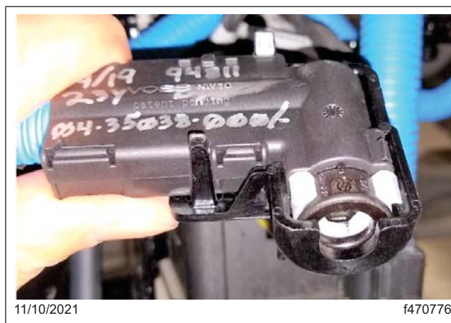
Fig. 3, Reinforcement Cap Installation