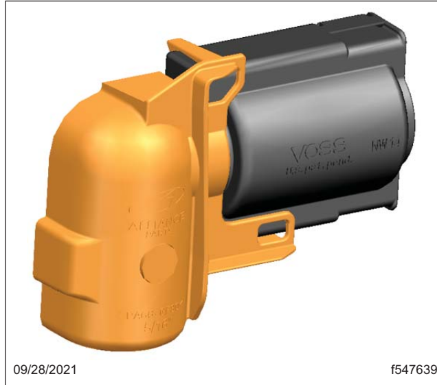
Fig. 5, DEF Tank Reinforcement Cap Installed (reverse angle)

> Business Class M2 > Cascadia > 108SD/114SD > New Cascadia