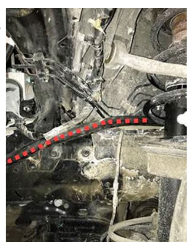
Figure 5. Route the 5/8" ID rubber hose from the new filter position to the J909.

5/8" ID rubber hose needs to be routed in a way that there are no sharp bends to prevent kinking.