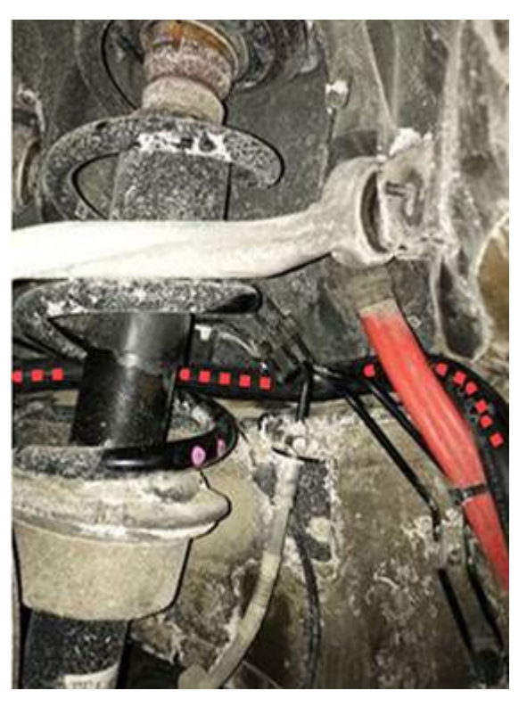
Figure 6. Routing the rubber hose.