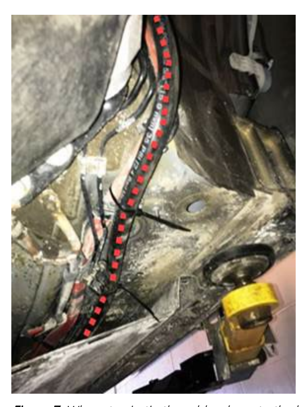
Figure 7. Where to zip tie the rubber hose to the battery cable.

4. Routing details to the J909, along the orange battery cable. Add zip-ties every 12 inches (Figure 7).