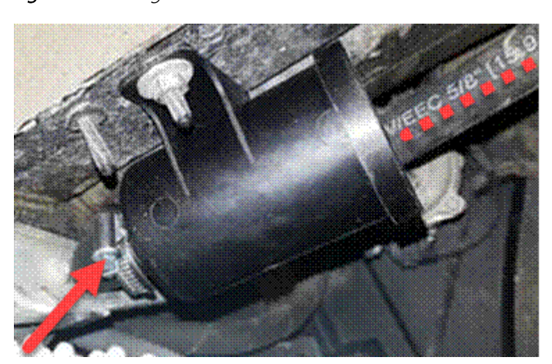
Figure 4. Connecting the NLVD filter.

2. Connect the filter to the 5/8" ID rubber hose via 1x plastic elbow and 1x rubber elbow (Figure 4).