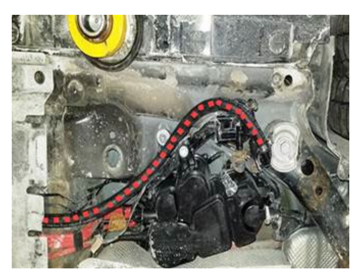
Figure 8. Connecting to the J909.

5. Before connecting 5/8" ID rubber hose to 90 degree connector, cut to length, as needed. Connection details to the J909 are shown in (Figures 8 and 9).