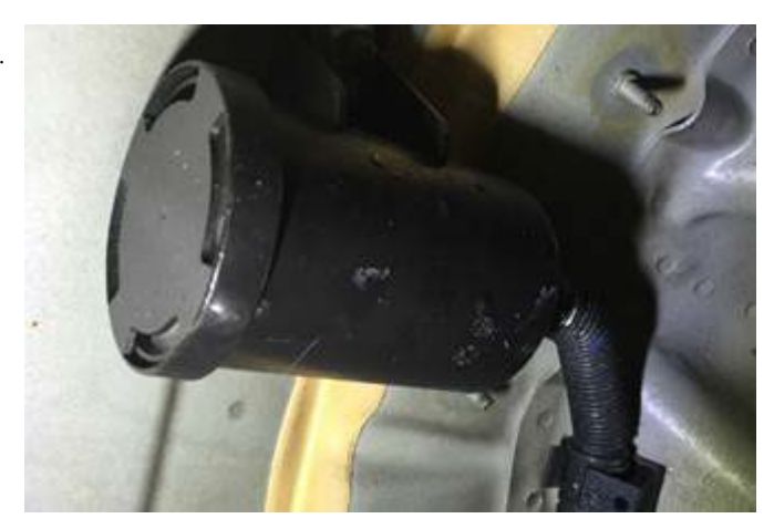
Figure 10. Remove original NVLD filter.

Remove original NVLD filter assembly. (Figure 10).