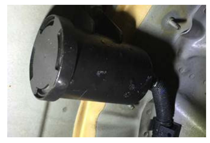
Figure 2. Ventilation tube of the EVAP canister.