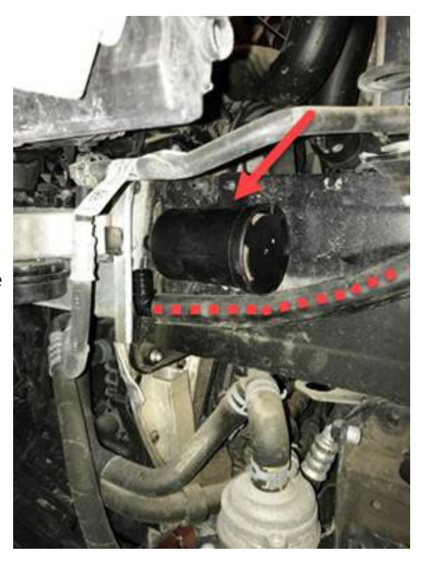
Figure 3. Installing the new NLVD filter.

2. Connect the filter to the 5/8" ID rubber hose via 1x plastic elbow and 1x rubber elbow (Figure 4).