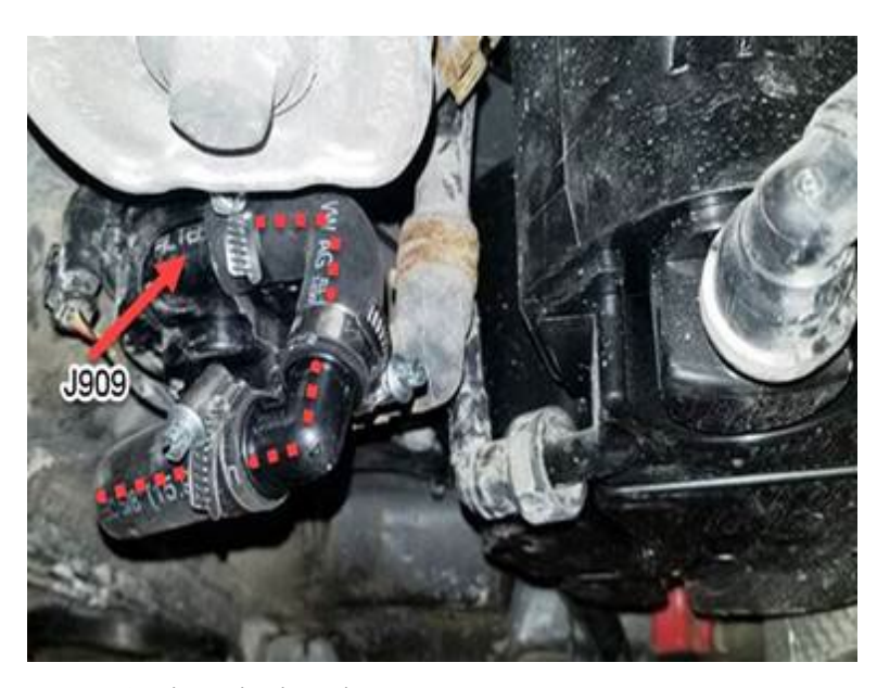
Figure 9. Closer look at the connections.

Remove original NVLD filter assembly. (Figure 10).