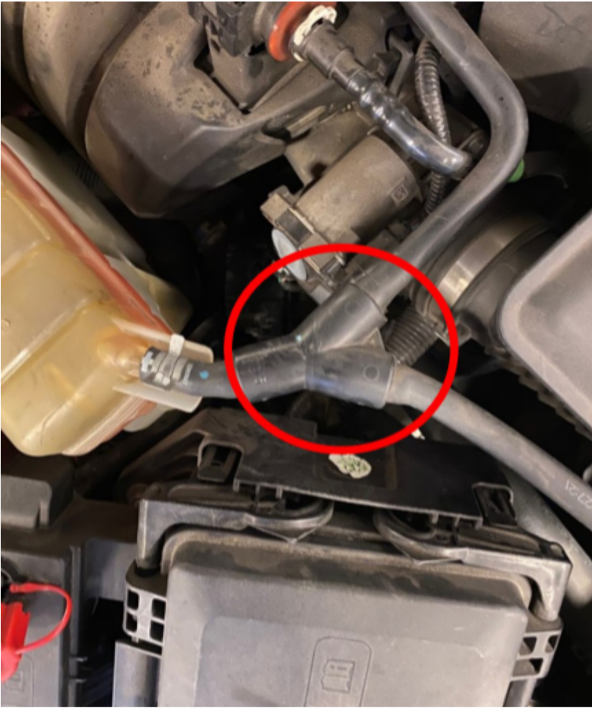
Coolant "Y" Hose Leak