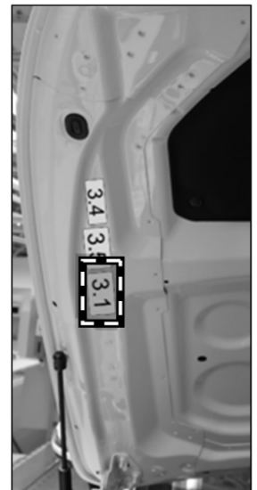
Figure 4 (Model 257)