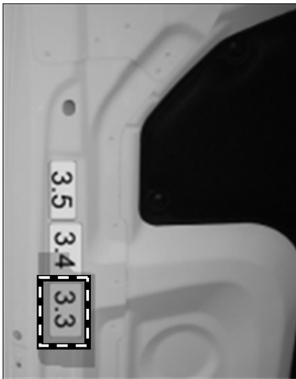
Figure 2 (Model 213)