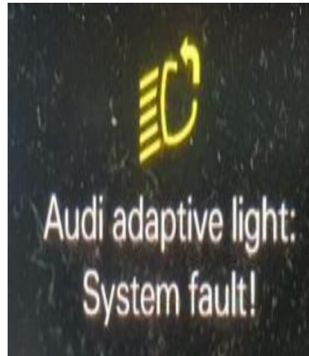
Figure 1. Instrument cluster message.