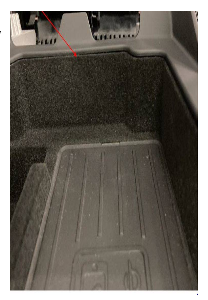
Figure 3. Center console upper section to storage bin gap, even and approx.0.5 mm wide.

7. Recheck the gap of the center console upper section (Figure 3). The gap should be even and approx.0.5 mm.