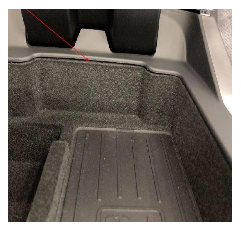
Figure 1. Check the gap between the center console upper section and the storage bin.

Check the gap between the center console upper section and the storage compartment (Figure 1). The gap should not exceed 0.5 mm.