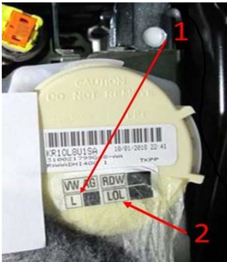
Figure 2. Example of left Q8 seat belt (-L- pos. -1-) for left hand drive (LHD) car (-L0L- pos. -2-).