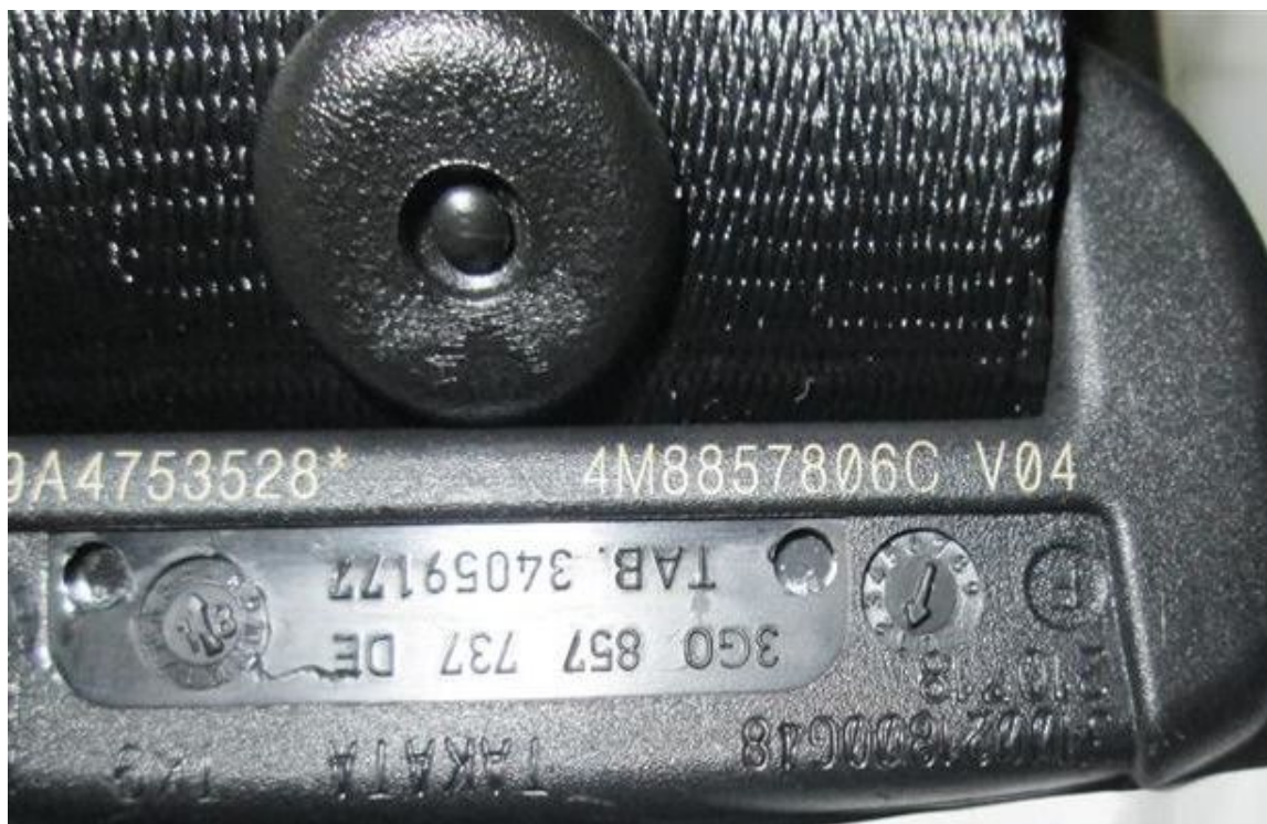
Figure 1. Sample part number of right rear Q8 seat belt shown.