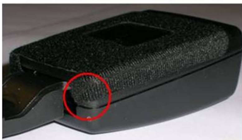
Figure 1. Felt mat 8V0 858 541 attached to belt buckle.