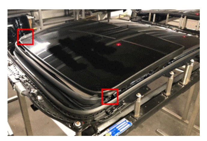
Figure 2. Front sunroof glass panel side skirt protrusion from an unmodified water quidance washer.