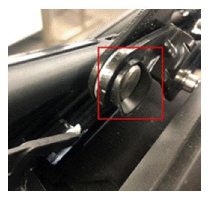
Figure 3. Water guidance washer on the front frame mechanism pivot.

3. Figure 3 shows the water guidance washer with the front sunroof glass panel removed.