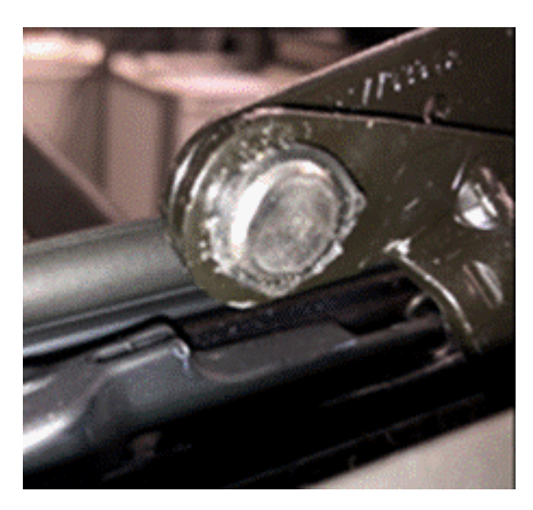
Figure 5. Water guidance washer on the front frame mechanism pivot.

5. Figure 5 shows the removed water guidance washer trimmed below the pivot pin. Since this pivot pin is concealed by the front sunroof glass panel "skirt" it is not necessary to smooth the edges of the cut surfaces.