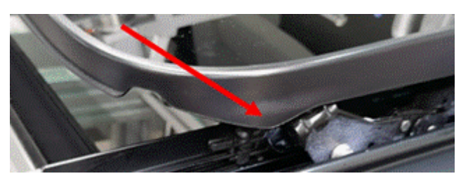
Figure 1. Front sunroof glass panel side skirt deformed due to a protruding water guidance washer.