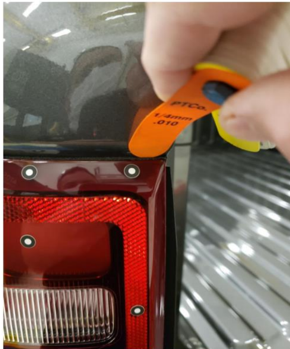
Fig 1. Left tail light upper corner tight to bed.

Customer Complaint/Technician Observation: Tail light may be very tight and or cracked on inboard upper corner area (fig 1).