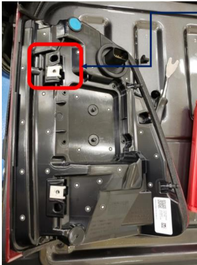
Fig 2 Tail Lamp removed and location of upper locator hole

Discussion: If the gap is tight on the tail lamp (fig 1) the lamp housing fit can be improved. A de-bur tool (fig 3) or a sharp hobby knife can trim the forward edge of the upper locating hole of the tail lamp. Using PPE (personal protection equipment) and safety precautions, carefully trim the forward edge of the hole as shown 1.5mm. Refer to Service Library for details on removal of tail lamp. 08 - Electrical / 8L - Lamps and Lighting / Lamps/Lighting - Exterior / LAMP, Tail Stop Turn / Removal and Installation