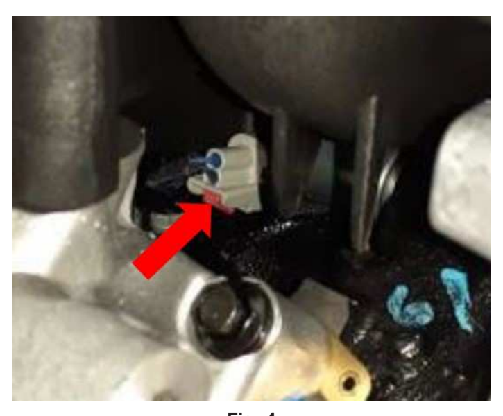
Fig. 4 Oil Control Valve Connector Red Secondary Lock