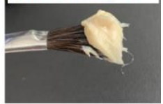
OK - enough grease