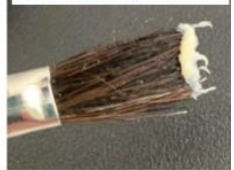
NOK - too much grease