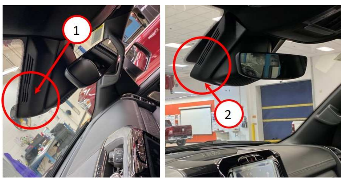
Fig. 1 Failure As Seen By Customer

1 - Example of Good IRCM bracket Adhesion.