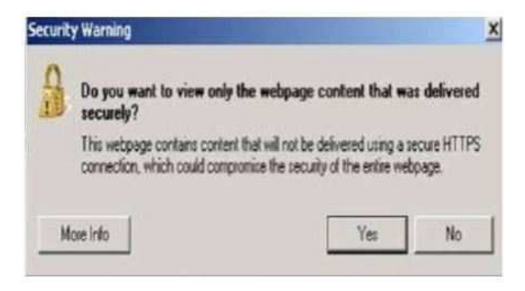
Fig. 1 Pop-up Security Message

3. If a security message appears "Do you want to view only the web page content that was delivered securely?" (Fig. 1) Press 'No' to continue.