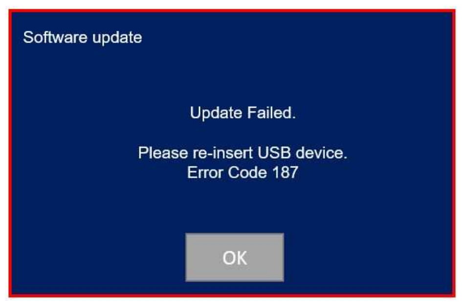
Fig. 7 Error Message Display

11. If you see during reflash on the screen any error message like "Error code 187, 255 or 260" there is a reading problem with USB stick. Just reinsert USB and if it repeats use another USB stick (Fig. 7).