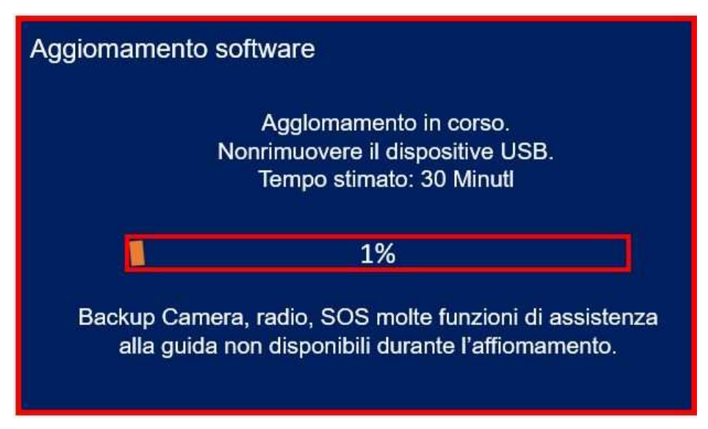
Fig. 8 Percentage Completed Screen

NOTE: There will be a variety of screens displayed throughout the update process. A black screen will appear multiple times in the process for a few minutes (Fig. 8).