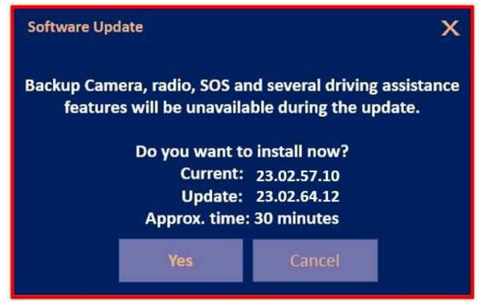
Fig. 6 Radio Software Level

8. The next screen display will have the current and update software levels. The radio will be updated to 23.02.64.12 (Fig. 6) .