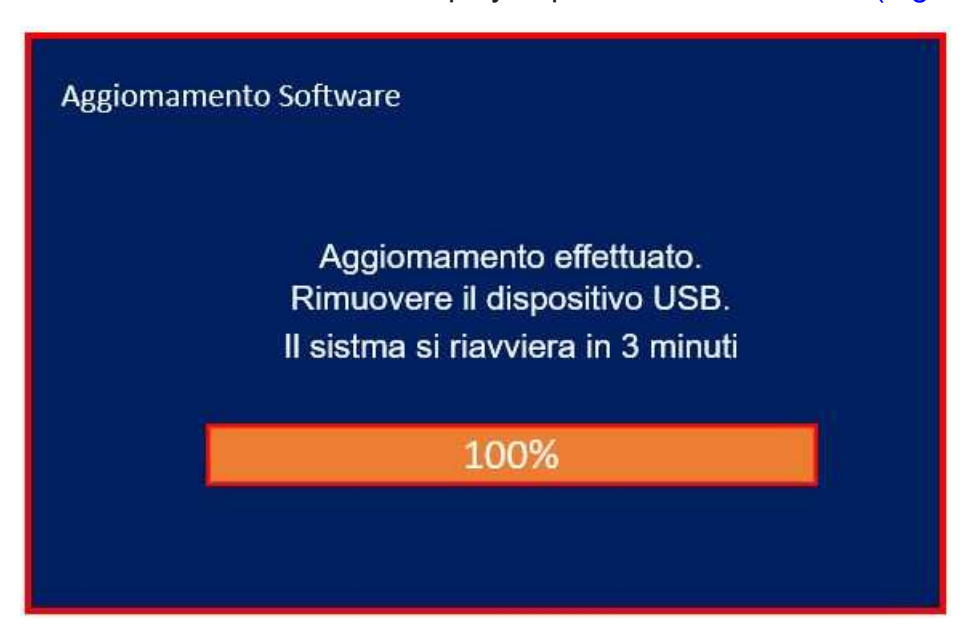
Fig. 9 Update Successful Screen

13. After the update is done the screen will display "Update successful" see (Fig. 9).