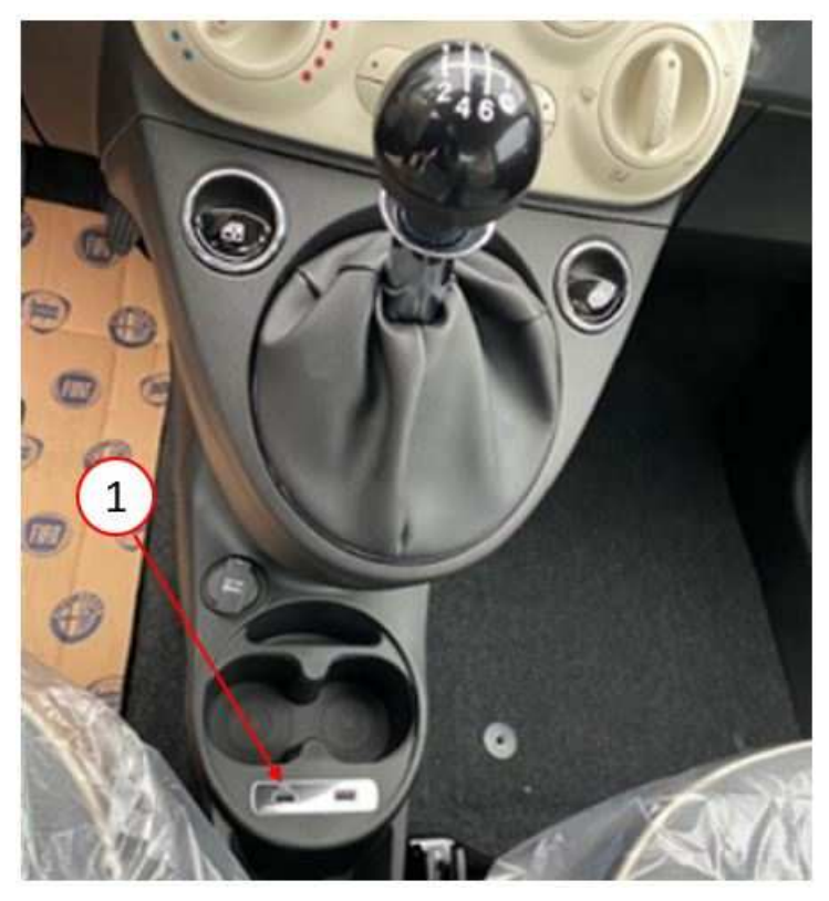
Fig. 5 USB Port Location

7. Insert the correct USB flash drive with new software into USB port (Fig. 5) .