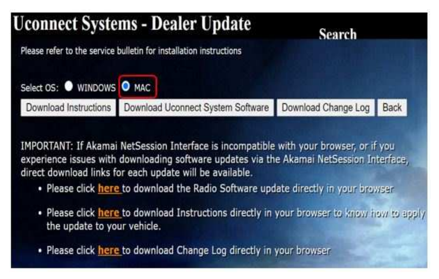
Fig. 2 MAC Download

4. Download the software update file to your local PC's desktop. Make sure to select the "MAC" radial button for all downloads (Fig. 2) .