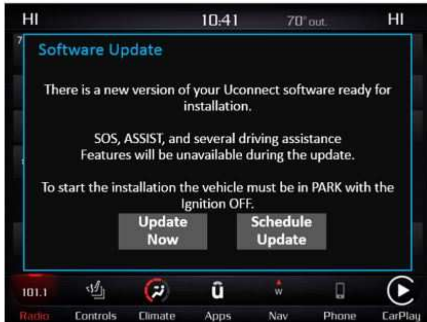
Fig. 1 Software Acceptance Screen

NOTE: This is an “Information Only” Service Bulletin to inform the dealer how the FOTA update is performed and any symptom/condition that this enhancement corrects. This document does not contain a LOP for reimbursement.