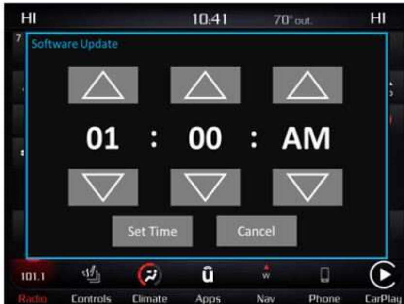
Fig. 2 Schedule Update Screen

NOTE: If selecting “Schedule Update” the screen below will be displayed. The customer can select the exact time they want the update to begin (Fig. 2) .