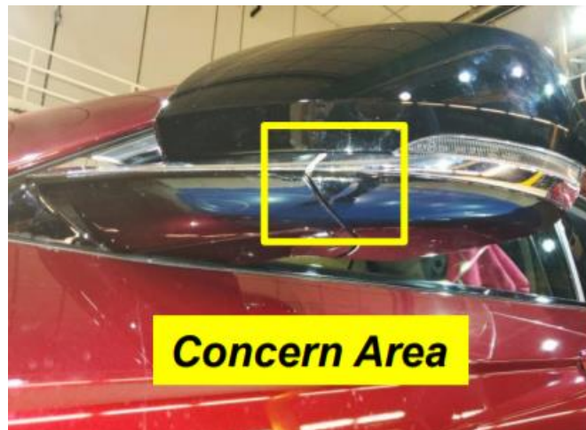
Fig 1 vertical seam

Discussion: Inspect the side mirror on the side that has the noise complaint. Attempt to duplicate the condition with 1 window down at a time driving speeds from 30-60mph. If duplicated, apply a piece of tape over the vertical joint shown in Fig 1 and test drive the vehicle again in the same manner. If the noise is gone with tape applied- perform the repair below.