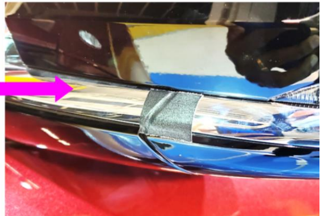
Fig. 1 : Vertical seam

Tape the vertical gap between both Mirror Base and Mirror Head Accent Pieces as following - Chrome or Painted finish