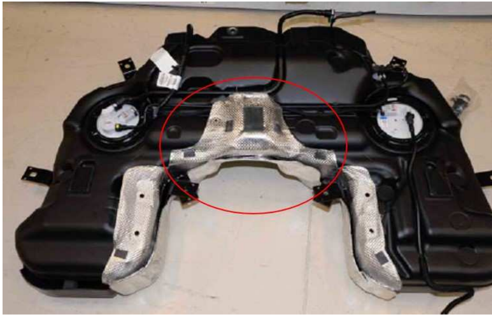
Fig. 2 Correct Heat shield Installed