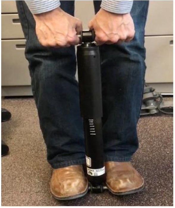
Fig 2 Damper Priming

Prior to installation the damper needs to be purged with the ROD END UP and Body down. Using long screw drivers or bolts as handles prime the damper full strokes 5 times as shown in fig 2.