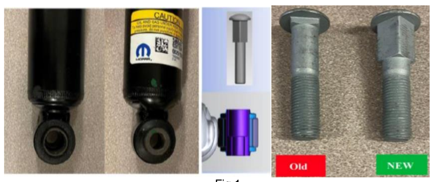
Fig 1 New mounting bushing and bolt design

Customer Complaint/Technician Observation: Steering Damper 68251580AF has updated mounting to ensure the damper goes on the correct direction (fig 1). The AF level damper requires a new outboard attachment bolt be installed that features a longer square shoulder 06513445AA (new in fig 1). As with past practice the bolt must be replaced every time the damper is serviced.