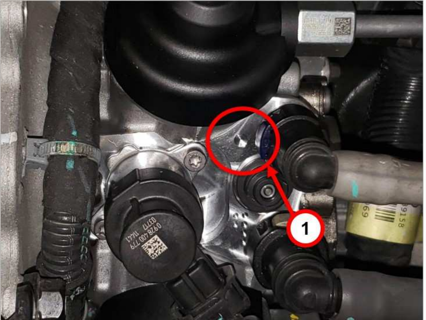
Fig. 1 New Style Symmetrical Cam Design Pump