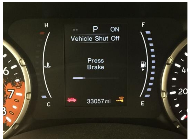
Step 5. First, press and hold the brake pedal AND THEN press and hold the OK button. The Press Brake timer will start.

This document does not authorize warranty repairs. This communication documents a record of past experiences. STAR Online does not provide any conclusions about what is wrong with the vehicle. Rather, it captures all previous cases known that appear to be similar or related to the vehicle symptom / condition. You are the expert, and you are responsible for deciding on the appropriate course of action.