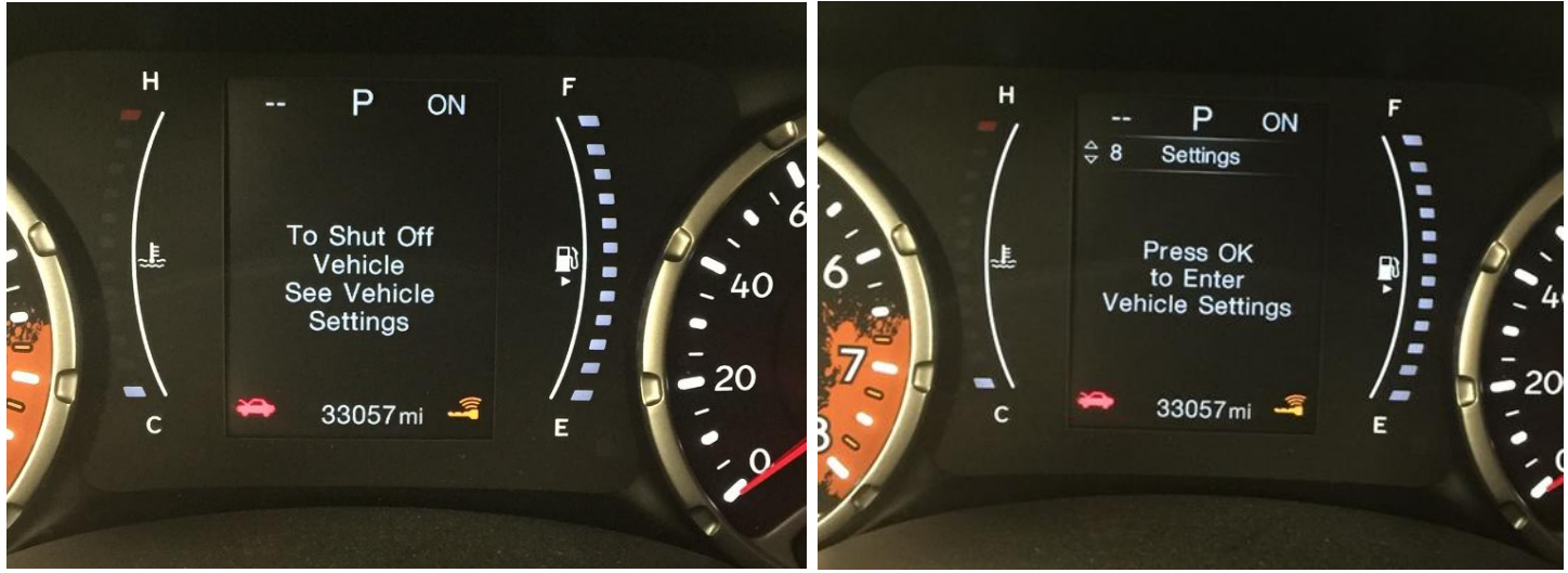
Step 1: Using the EVIC Controls, enter to the "Settings" Menu

Note: Ensure the vehicle is parked in a safe location which is accessible by a tow vehicle. The vehicle <u>WILL NOT RESTART</u> after performing this procedure unless the fault is cleared or the battery is disconnected