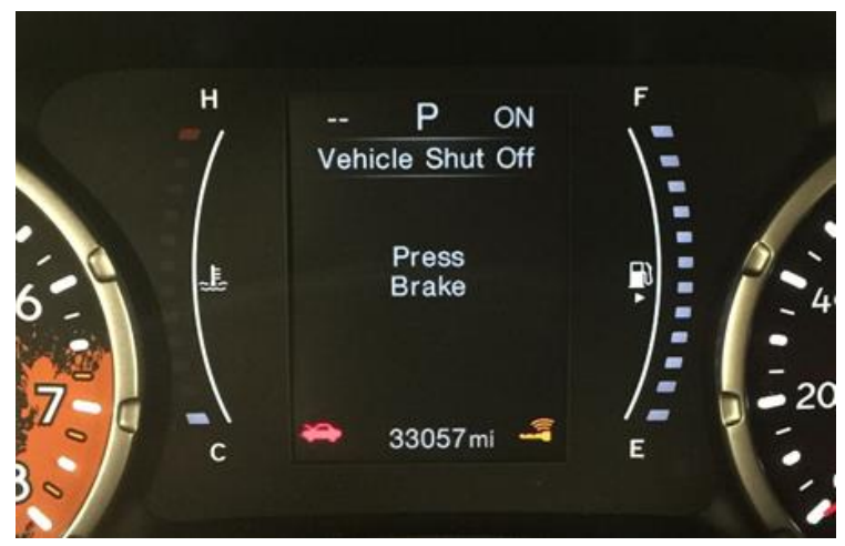
Step 4: Once the timer has completed and the "Press Brake" message is displayed. You must release the OK button.