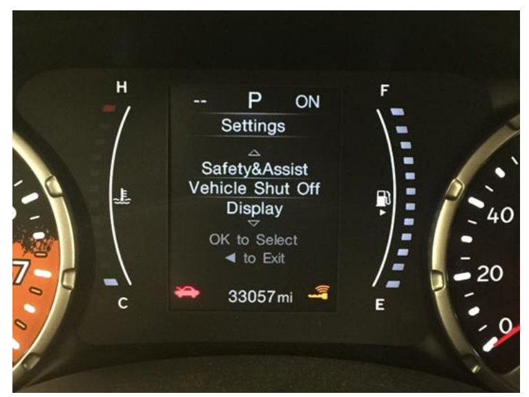
Step 2: Navigate and select "Saftey&Assist Vehicle Shut Off"