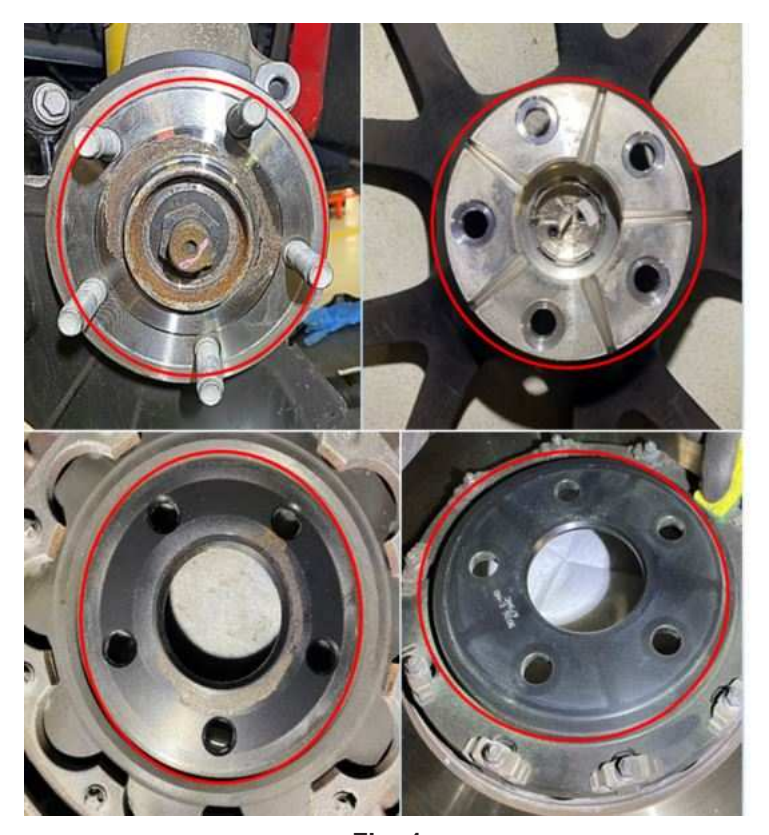
Fig. 1 Areas That Needs To Be Cleaned

3. Use small amount of adhesive between friction disc and hub to hold disc centered on hub (Fig. 2).