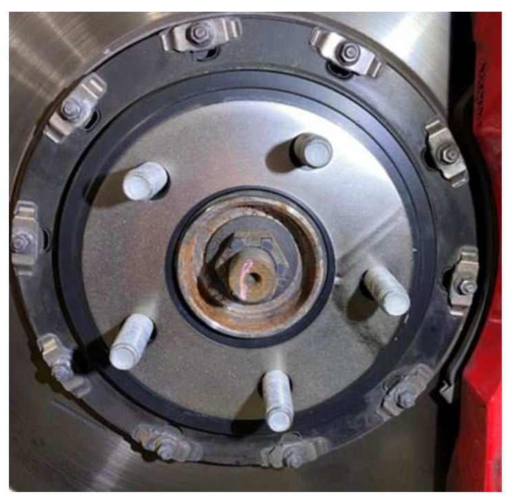
Fig. 4 Friction Disc Installed On The Rotor

5. Put both rotors back onto the hubs and apply a small amount of adhesive in the center of he friction disc. Put both friction discs on the outside of the rotors (Fig. 4).