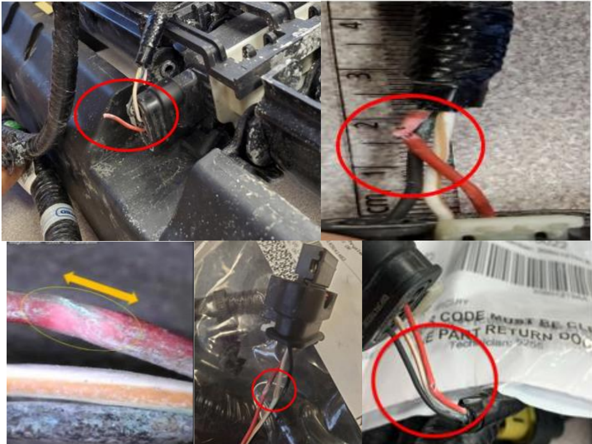
Damaged AGS Wiring Harness Near D2826A

This document does not authorize warranty repairs. This communication documents a record of past experiences. STAR Online does not provide any conclusions about what is wrong with the vehicle. Rather, it captures all previous cases known that appear to be similar or related to the vehicle symptom / condition. You are the expert, and you are responsible for deciding on the appropriate course of action.