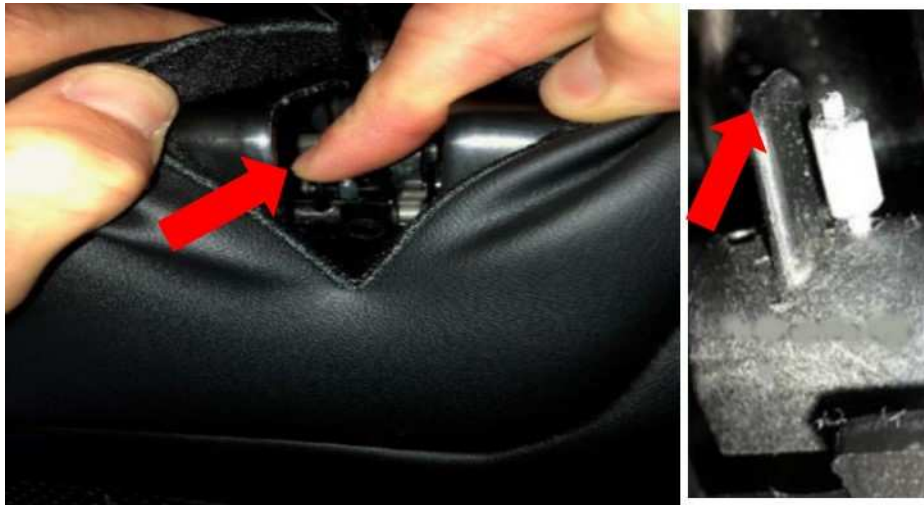
Fig. 5 Horseshoe Clip Fin