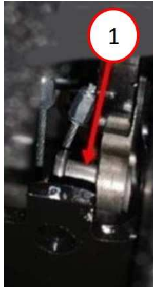
Fig. 3 Exposed Pin With No Horseshoe Clip