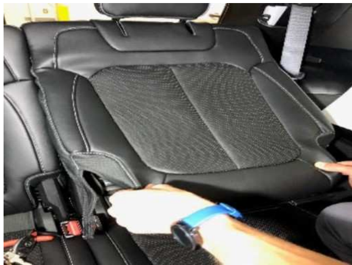
Fig. 6 Trim Cover