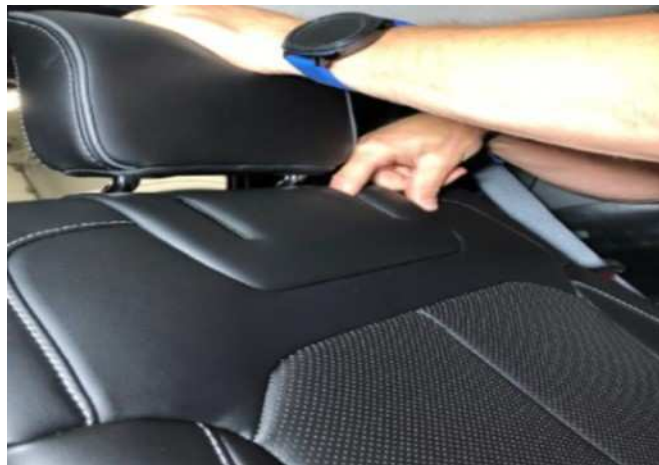
Fig. 4 Pulling Headrest Forward