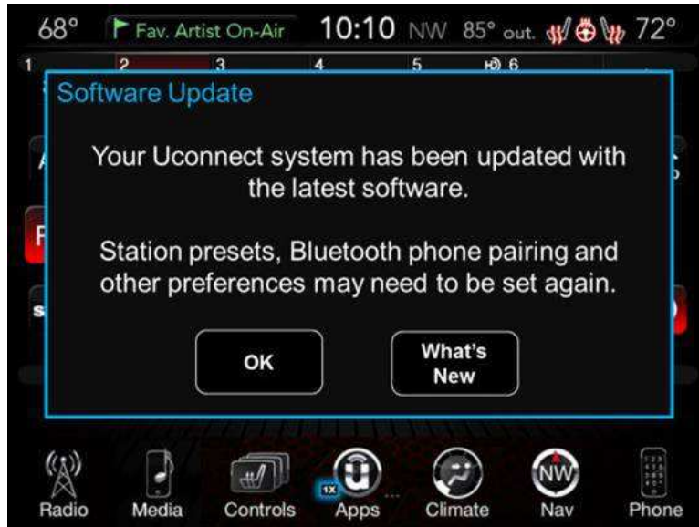
Fig. 4 Confirmation Screen