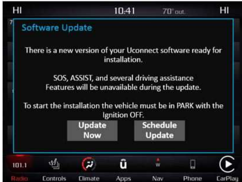
Fig. 1 Software Acceptance Screen

NOTE: This is an “Information Only” Service Bulletin to inform the dealer how the FOTA update is performed and any symptom/condition that this enhancement corrects. This document does not contain a LOP for reimbursement.